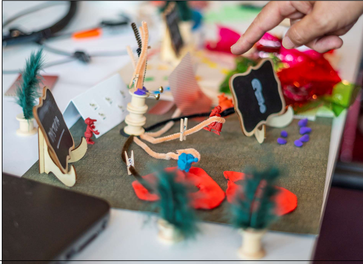
One we made earlier